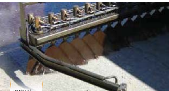
Optimal spraying quality