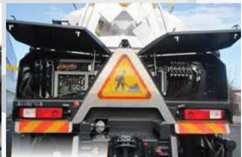
Enhanced security / Easy maintenance