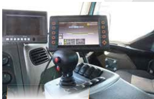
Driv'ER 2 : Automated operating / job follow up