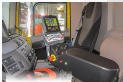
SMART16 : Automated and easy operating