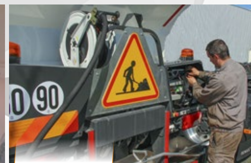
Enhanced security / Easy maintenance