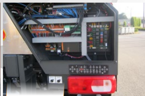
Enhanced security / Easy maintenance