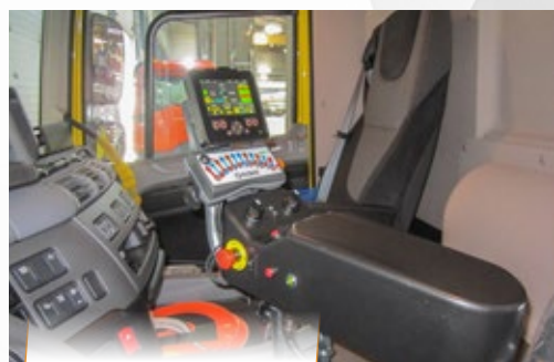
SMART16 : Automated and easy operating